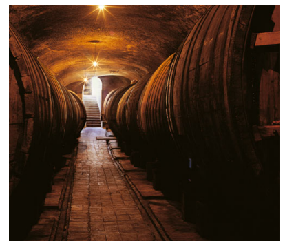
The stone-walled aging cellar was carved into the Moncayo mountain that overlooks our winery by our ancestors over 500 years ago.